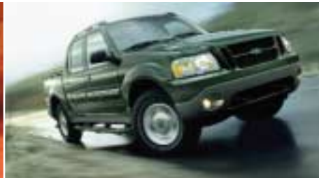
EXPLORER SPORT TRAC